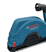
GDE 230 FC-T Professional Part no.: 1.600.A00.3DM