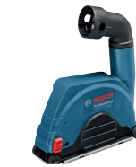
GDE 115/125 FC-T Professional Part no.: 1.600.A00.3DK