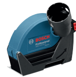
GDE 125 EA-S Professional Part no.: 1.600.A00.3DH