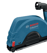
GDE 230 FC-S Professional Part no.: 1.600.A00.3DL