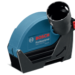
GDE 125 EA-T Professional Part no.: 1.600.A00.3DJ