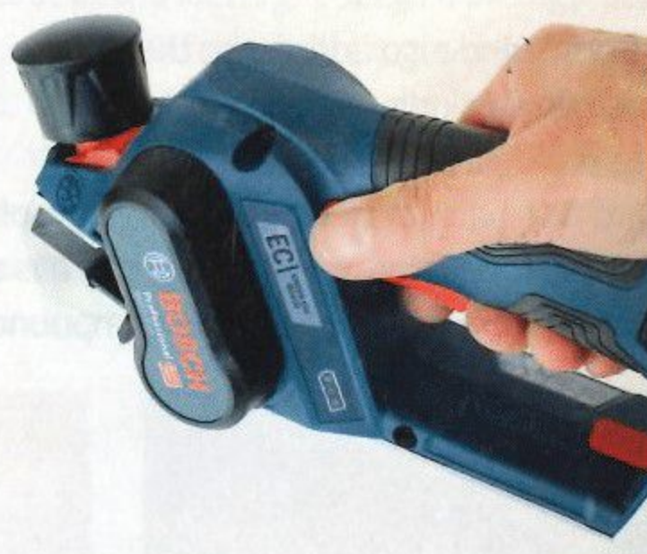
One-handed operation is the norm for this planer