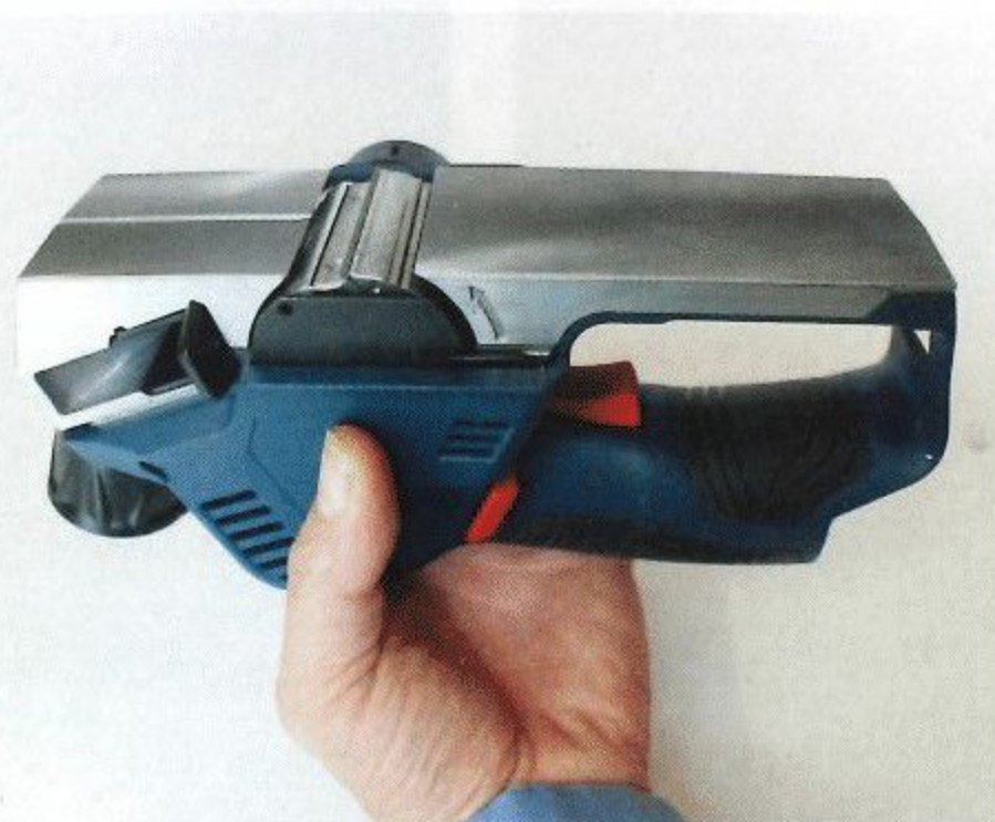
Accurate milling on the aluminium base ensures consistent accuracy