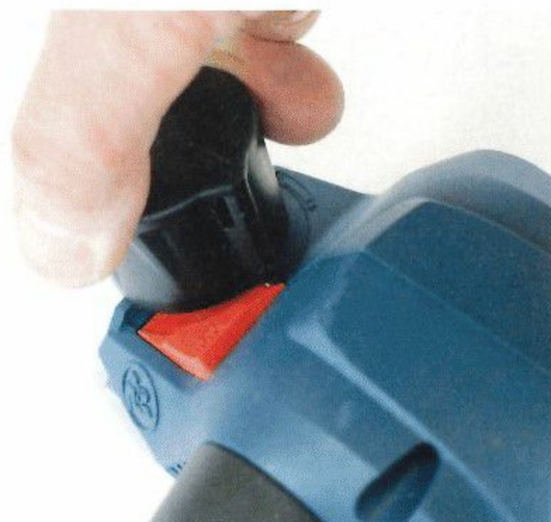
1st stop; depressing the 'Maximum' button will gain you an additional millimetre of cut