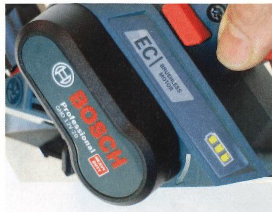
The battery indicator enables the user to know at a glance just how much working power remains